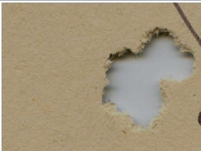
H&N Baracuda .20 Caliber