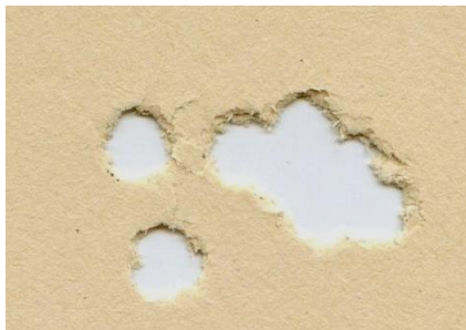
H&N Field Target Trophy .25 Caliber