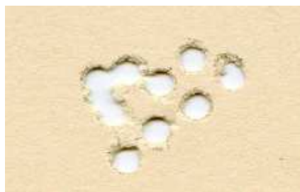
H&N Silver Point .177 Caliber